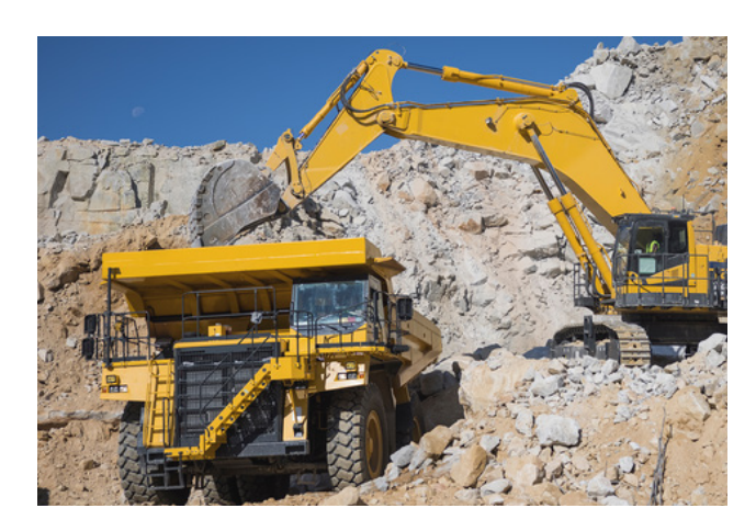
Autonomous driving is not limited to cars, buses or delivery vans. Mobile machines such as excavators or earthmovers, have a great potential for automation.

mercially available so-called COTS platforms (for commercial off-the-shelf). These allow design engineers to create individual solutions without the need to deal with individual components.