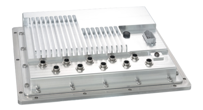
What makes the electronics a ready-to-install, ruggedized system is its purpose-designed housing. With only 60 W maximum power consumption, the system needs no active ventilation or cooling.

In spite of its exorbitantly high computing power of the fully loaded unit and its multiple interfaces, MicroSys managed to limit its power consumption to 60 Watt, creating a system without any moving parts and without the need for active cooling. "All tests confirm sufficient cooling up to ambient temperatures of at least 55° C", says Jörg Stollfuß, Application Engineer at MicroSys Electronics GmbH. "With the new Autonomous Control Unit based on the miriac® MPX-LX2160A SoM, we can offer mobile machine manufacturers a ready-to-install control and automation system for their products."